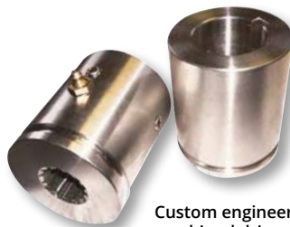
Custom engineered & machined drive couplings