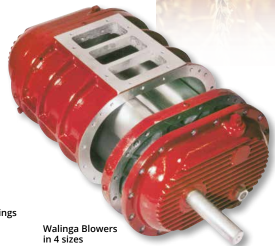
Walinga Blowers in 4 sizes